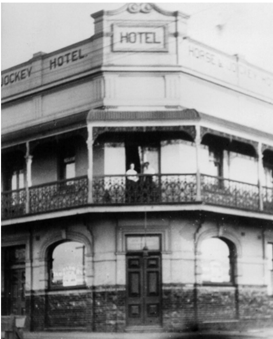
Horse and Jockey Hotel